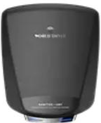
SANITIZE + DRY