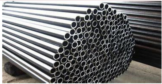
Aluminum Conduit and Fittings EMT and Rigid