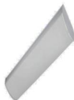
WARP LIGHT FROSTED