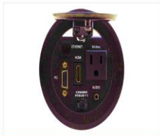
CONFERENCE TABLE BOXES IN-TABLE MOUNT: ROUND