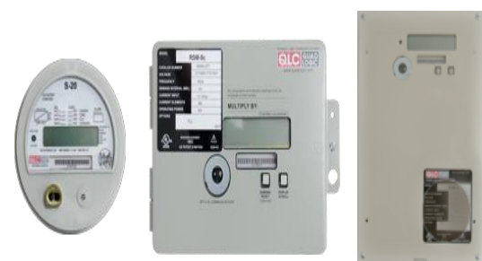
Submetering Hardware and Services