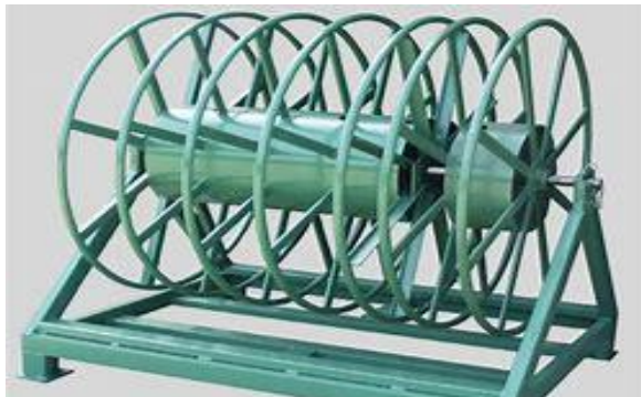
Reels, Storage Systems- Reel/Conduit/Coil/Elbow, Reel Handling-Take-up Equipment, Reel Handling-Payout Equipment.