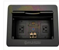
CONFERENCE TABLE BOXES IN-TABLE MOUNT: RECTANGULAR