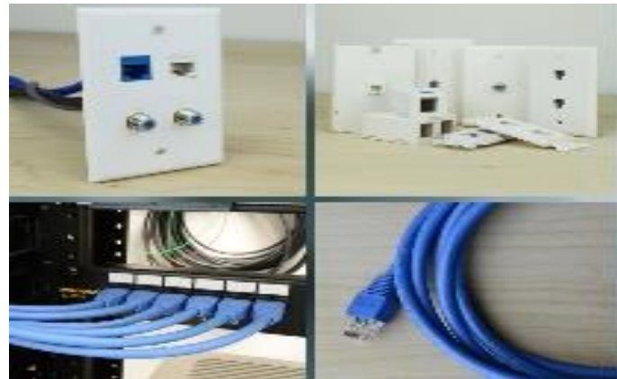
Data and Telecom patch cords, Connectors, Home Theatre and Patch Panels, Keystone Plates and Inserts