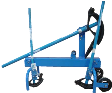
Aluminum Conduit Bender