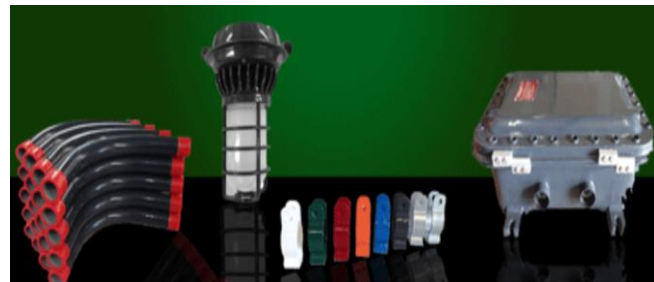
PVC Coated Conduit and Fittings