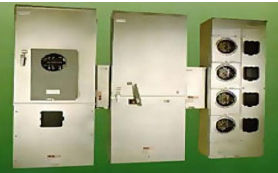
CT Cabinets & Metering Equipment