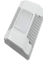
GAS STATION CP