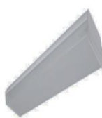
WARP LIGHT PRIMETIC