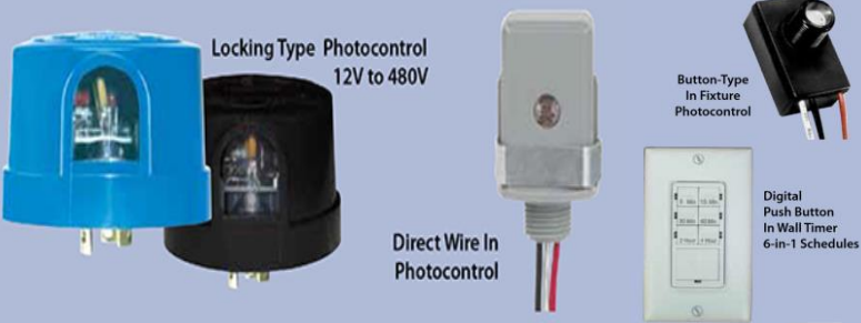
Timers, Photo Controls

FOR OVER 50 YEARS PRECISION THE #1 SOURCE FOR ENERGY SAVINGS CONTROLS