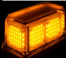
TYPHOON LED EMERGENCY LIGHT BAR