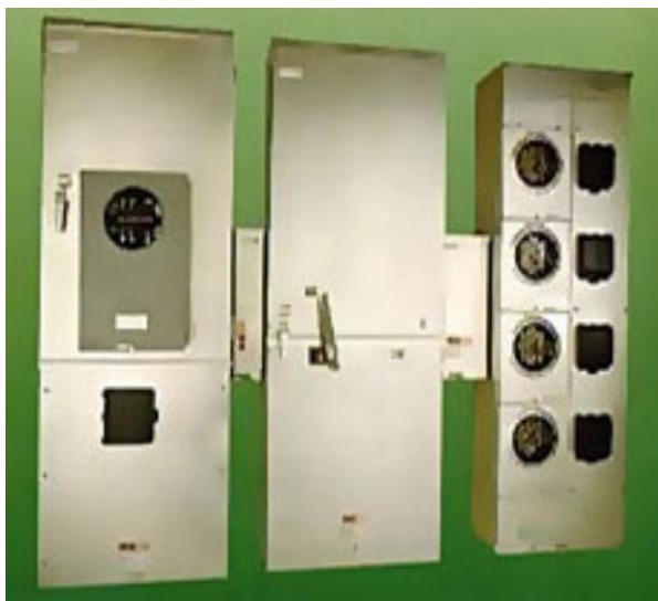
CT Cabinets & Metering Equipment