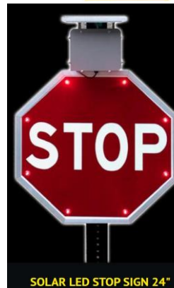
SOLAR LED STOP SIGN 24"