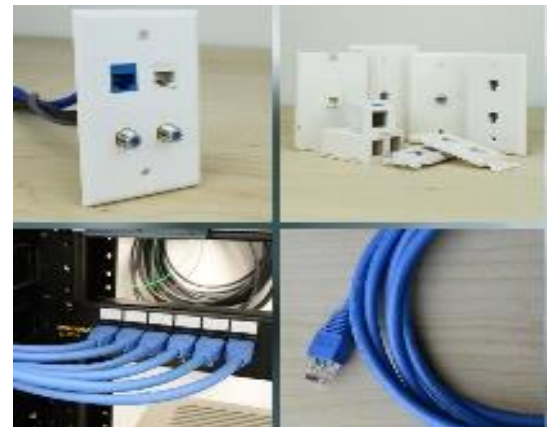
Data and Telecom patch cords, Connectors, Home Theatre and Patch Panels, Keystone Plates and Inserts