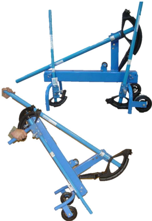
Aluminum Conduit Bender