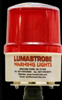
CRANE OBSTRUCTION LIGHT WITH 3/4" OR 1" HUB