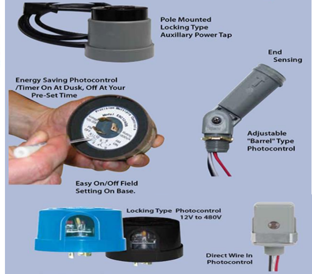
Timers, Photo Controls