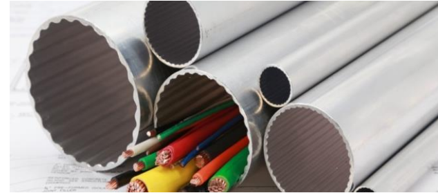
Aluminum Conduit and Fittings EMT and Rigid