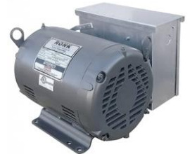
Meter Sockets, Automatic and Manual Transfer Switches Phase Converters Power Factor Correction Products