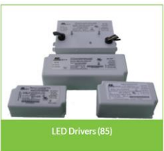
LED Drivers (85)