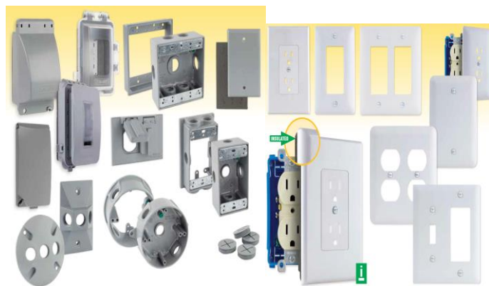
Weatherproof Covers, Ceiling fan and light fixture support, wall plates