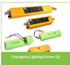
Emergency Lighting Drivers (6)