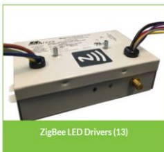
ZigBee LED Drivers (13)