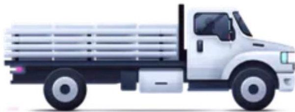
All-in-one logistics platform helping distributors move material fast, reliably, and professionally.