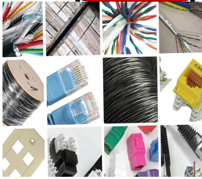
Networking, Category, Home Automation, Coaxial, Aluminum, Control Cables