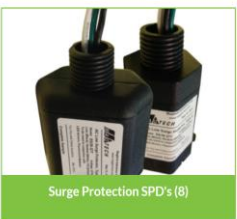
Surge Protection SPD's (8)