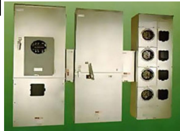
CT Cabinets & Metering Equipment