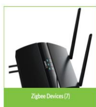
ZigBee Devices (7)