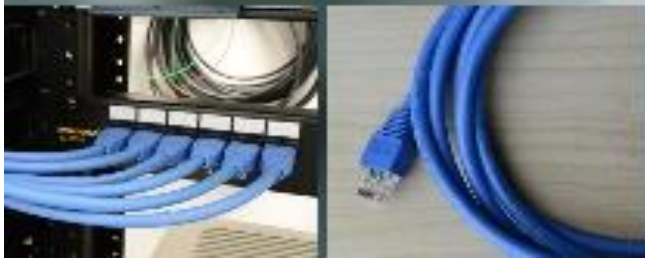
Data and Telecom patch cords, Connectors, Home Theatre and Patch Panels, Keystone