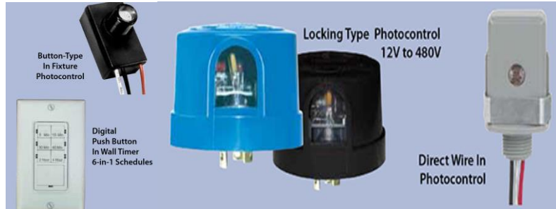
Timers, Photo Controls