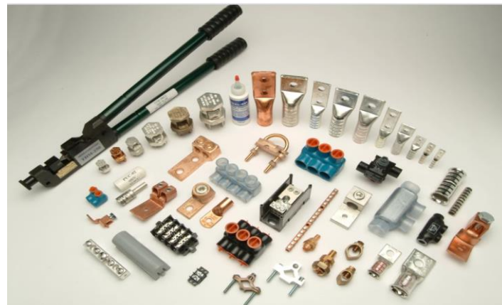
Electrical Connectors, Lugs, Compression Tools