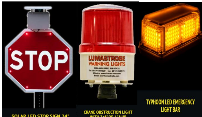
SOLAR LED STOP SIGN 24"