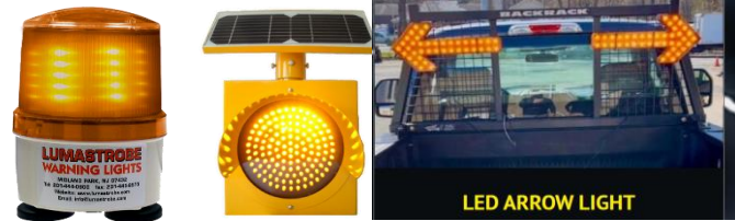
LED ARROW LIGHT