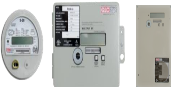
Submetering Hardware and Services