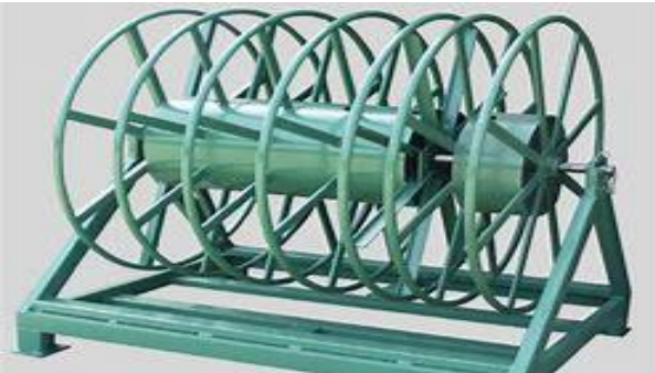
Reels, Storage Systems-

Reel/Conduit/Coil/Elbow, Reel Handling-Take-up Equipment, Reel Handling-Payout Equipment