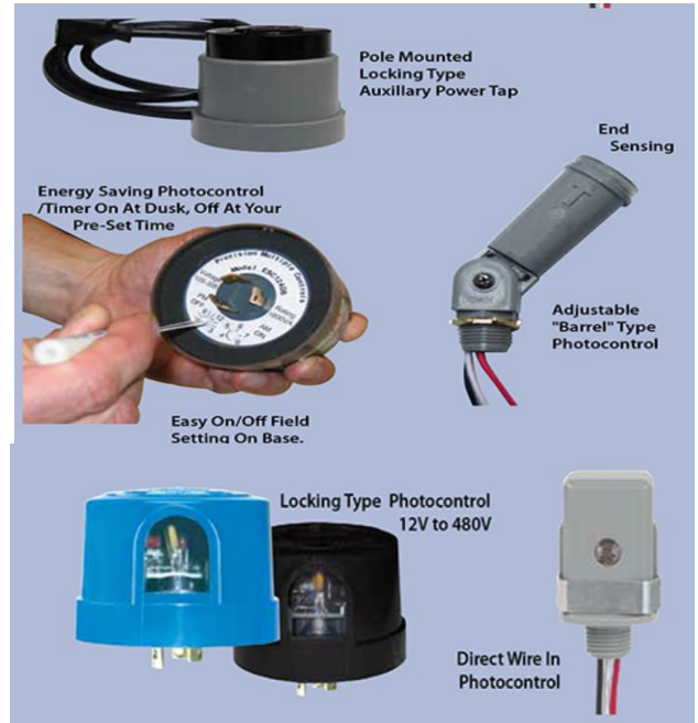
Photo Controls and Timers