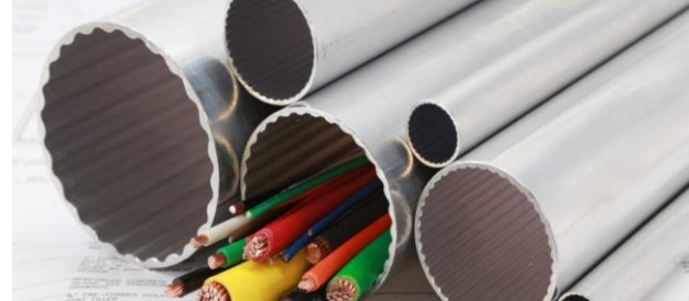
Aluminum Conduit and Fittings EMT and Rigid