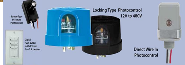
Timers, Photo Controls

Circuit Breakers, Fuses, Switchgear, Switchboards and Panelboards, Transformers, Electric Motors, Motor Controls, Transfer Switches, Disconnect Switches