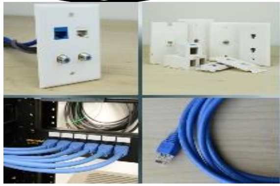
Data and Telecom patch cords, Connectors, Home Theatre and Patch Panels, Keystone Plates and Inserts