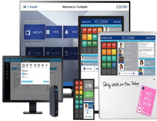
Hospital Android Powered televisions, Swing arm Televisions, Digital Whiteboards, Infection controlled Keyboards, Nurse call station