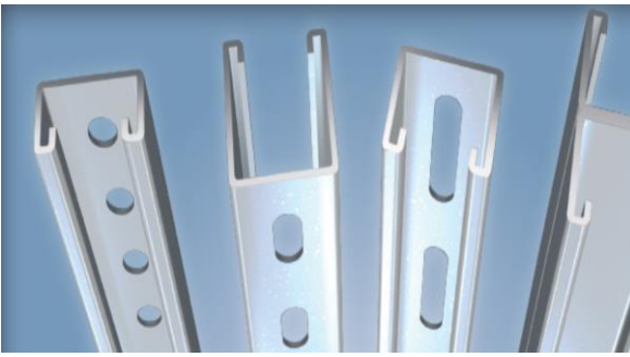
Strut and Accessories