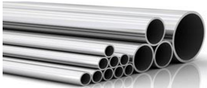
Steel EMT and Rigid Conduit

Circuit Breakers, Fuses, Switchgear, Switchboards and Panelboards, Transformers, Electric Motors, Motor Controls, Transfer Switches, Disconnect Switches