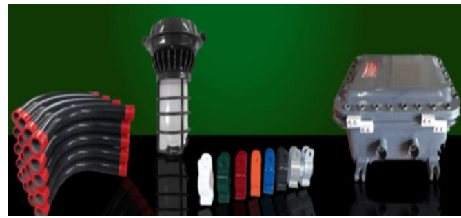
PVC Coated Conduit and Fittings