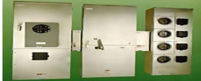
CT Cabinets & Metering Equipment