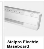
Stelpro Electric Baseboard