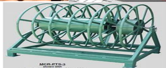
MCR-PTS-3 1 Standard MCR (3A, 4A or 5A) + 1 SCR

Reels, Storage Systems- Reel/Conduit/Coil/Elbow, Reel Handling-Take-up Equipment, Reel Handling-Payout Equipment. Min = 1 Freight = PPY/CHG