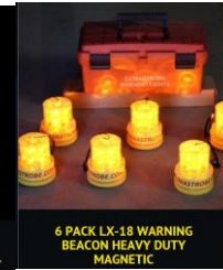
6 PACK LX-18 WARNING BEACON HEAVY DUTY MAGNETIC