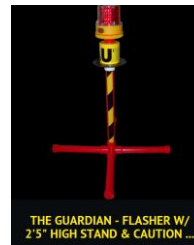
THE GUARDIAN - FLASHER W/ 2'5" HIGH STAND & CAUTION ...

Utility lights Min = 100 Freight = PP 60 PC