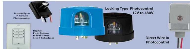
Button Type In Fixture Photocontrol

Timers, Photo Controls Min = 100 Freight = PP 60 PC